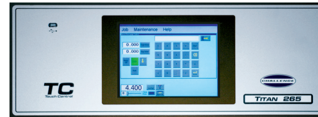
(Available as an option for the 200 & 230)