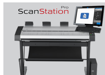
Operate Nextimage software directly on your scanner

Contex solutions are compatible with all leading large-format printers. See the full list at contex.com/nextimage-supported-printers