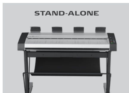
Operate your Nextimage software from a PC separate from the stand