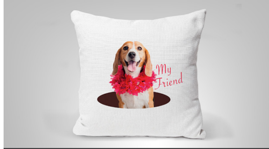
Add photos to fabric wall art, cushions, and other décor.