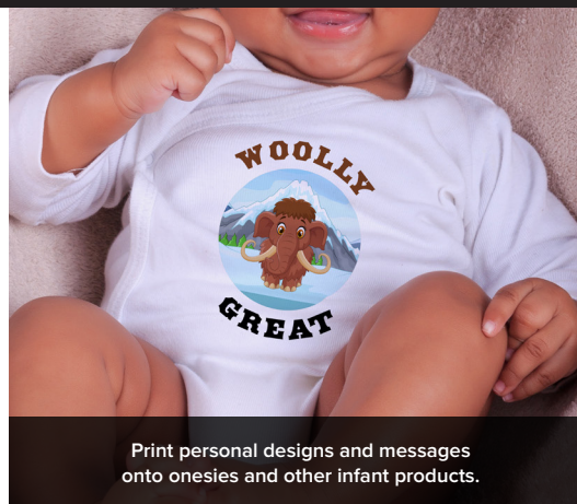
Print personal designs and messages onto onesies and other infant products.