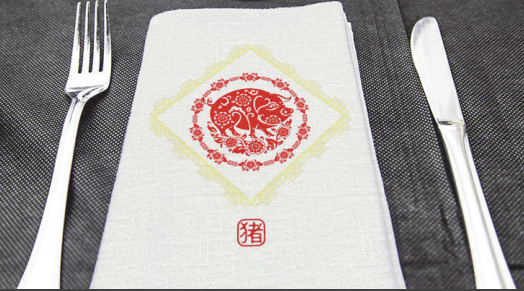
Make desirable gifts with handkerchief, apron, and other product personalization.