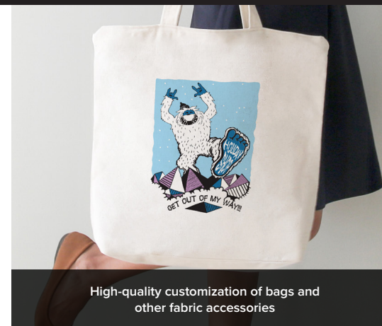
High-quality customization of bags and other fabric accessories