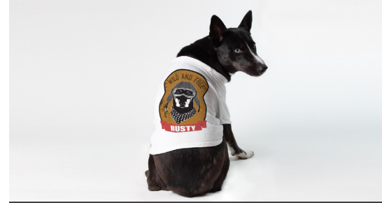
Personalize pet vests, dog bandanas and other profitable products.